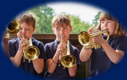
In Y4, children learn to play the djembe, ukulele and cornets.