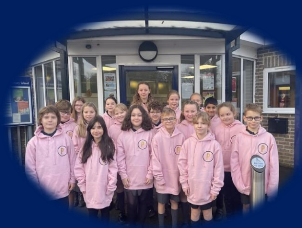
Our Peacekeepers, who facilitate friendships