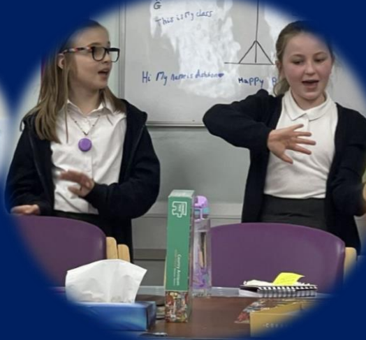
Singing with the older generation at a care home