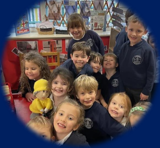
Excitement in topic immersion