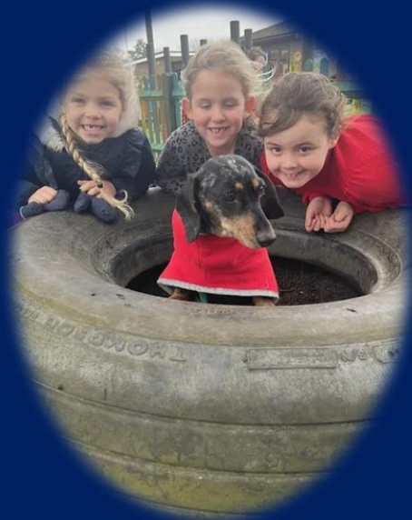
Star, our school dog who visits us

By following The Albourne Way, children are encouraged to grow into confident individuals with a strong sense of integrity, able to build strong, trusting relationships with others and give them a voice. "Carry each other's burdens, and in this way you will fulfil the law of Christ." Galatians 6:2