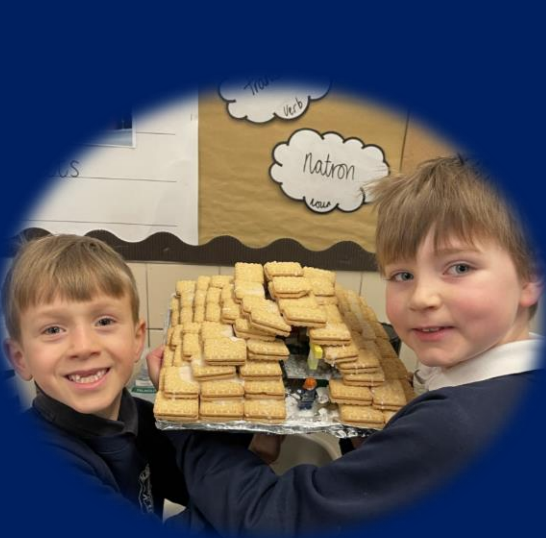
Exciting homework projects

We are committed to ensuring a broad and balanced curriculum, enriched with skills, knowledge and experience that equip pupils for the future. The curriculum is broad, rich and ambitious, underpinned by its Christian vision and values. 'The heart of the discerning acquires knowledge, for the ears of the wise seek it out.' Proverbs 18:15