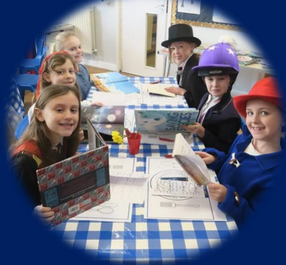
Whole school events – Book Bistro