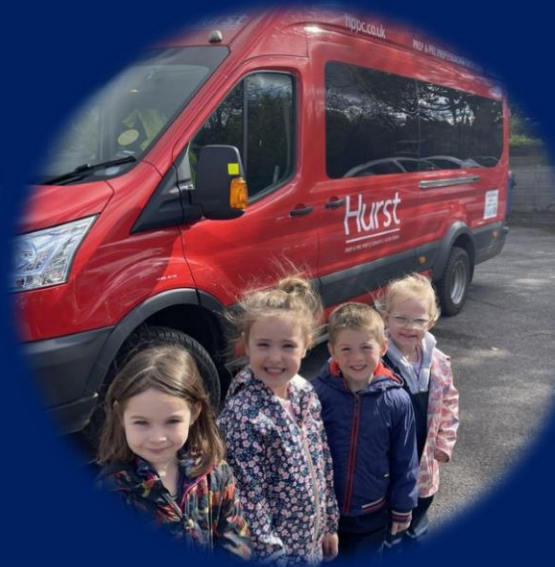
Off to Forest school @ Hurst