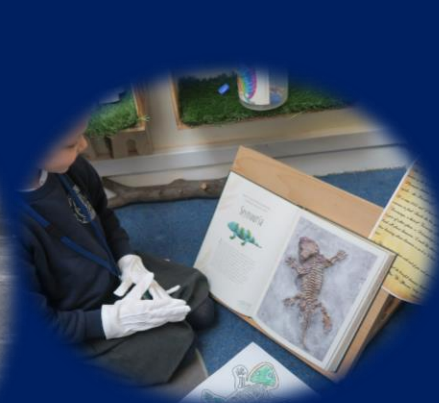
A letter from Mary Anning