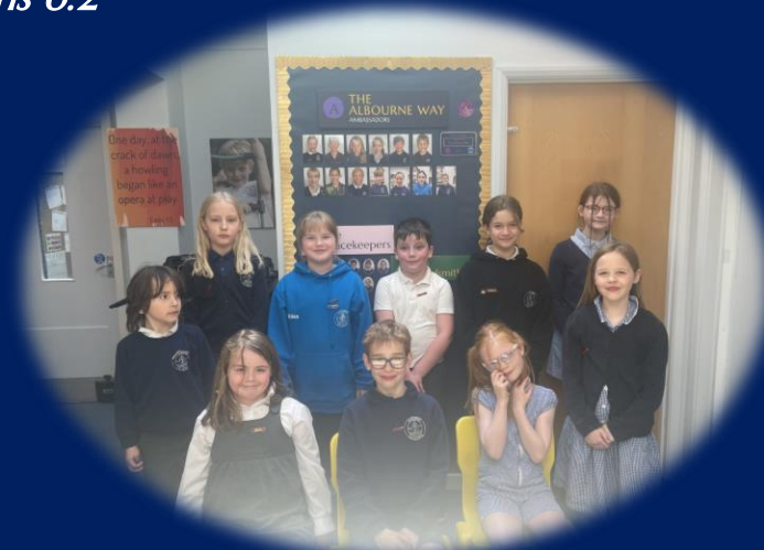
Our Diversity Ambassadors are role-models in improving understanding about differences