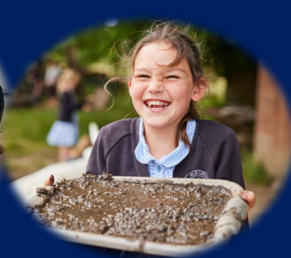
All ages can have fun